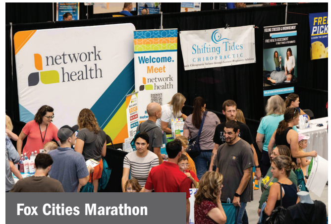
Fox Cities Marathon