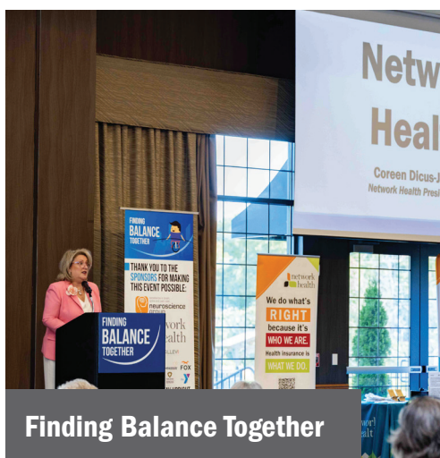
Finding Balance Together

community and wellness events serving more than 1,065 members