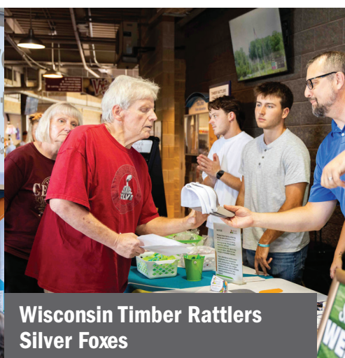
Wisconsin Timber Rattlers Silver Foxes