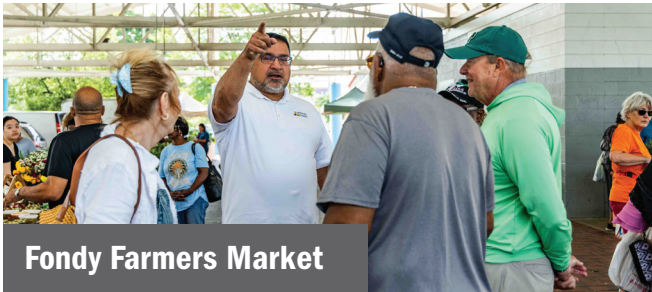
Fondy Farmers Market