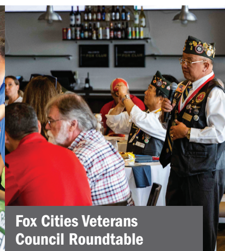
Fox Cities Veterans Council Roundtable