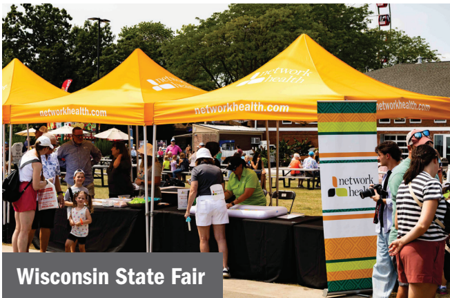
Wisconsin State Fair